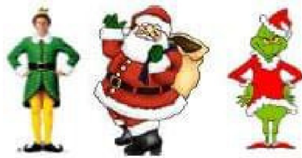
Foto Gratis con Papá Noel Dulces y Bebidas Regalos para los niños

Cordialmente los invita a unirse con el Departamento de Juventud de Bloom Township Al Evento de Diversión con Santa y sus Amigos